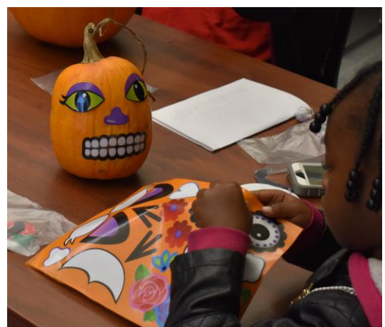
A child designs the face of her pumpkin